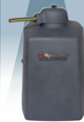
Swing Gate Operator

Ultra reliable/Low maintenance • Variable speed • Solar • Easy, inexpensive installation