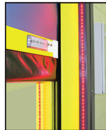
Pathwatch Safety Light System indicates door closing Turbo-Seal Insulated pictured above