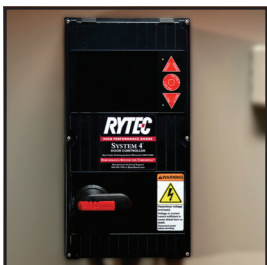
System 4 shown with optional rotary disconnect