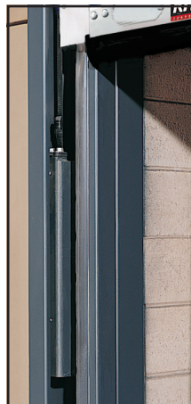
Counterweights within side column assist the motor in opening and closing the door