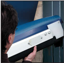
Break-Away tabs are easily reinserted into the side columns