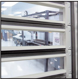
Nine inch high vision slats for increased visibility