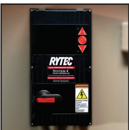
System 4 shown with optional rotary disconnect