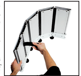
Integral rubber weatherseal