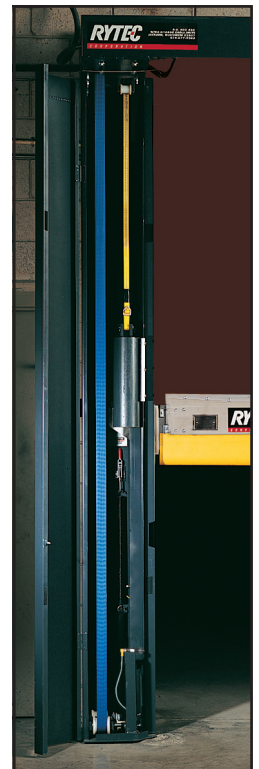
Patented System II independent counterbalance and tensioning system.