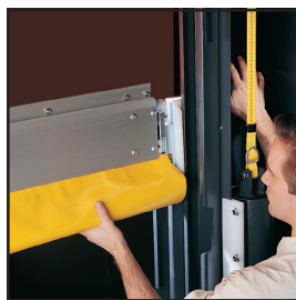
Easily resets, without the need for tools