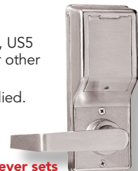
Lever sets feature clutch mechanism ensuring longer life and complies with ADA specs providing barrier-free access to the disabled.