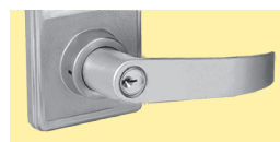
Regal handle option

COMPLIANCES: Grade I, heavy duty cylindrical lockset, UL listed to the 10C Positive Pressure Specification and FCC certified. ADA compliant levers.